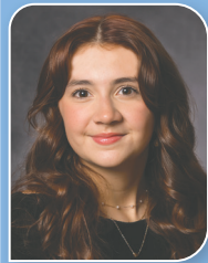
CAMBER BUZZE R.L. Patton High